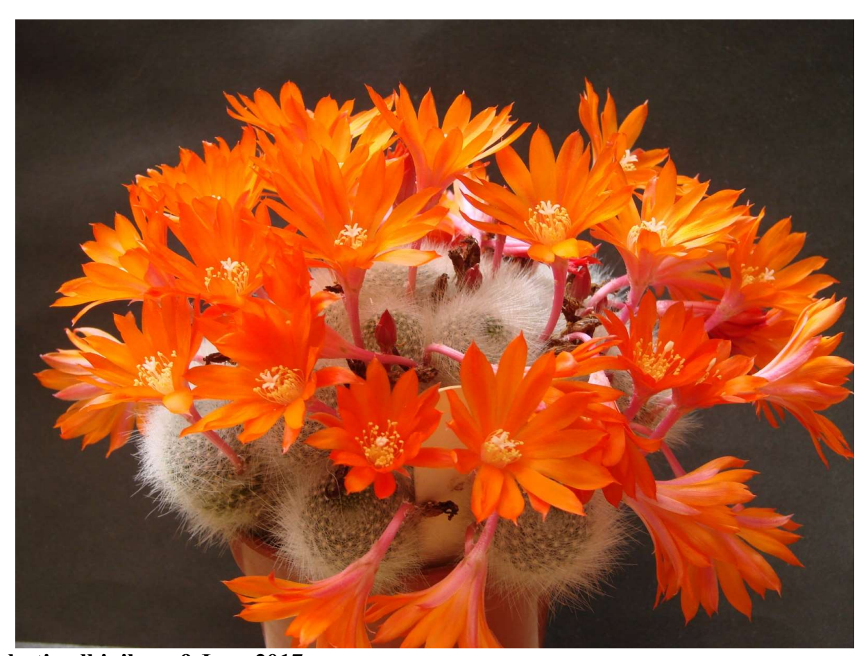
Rebutia albipilosa, 9 June 2017